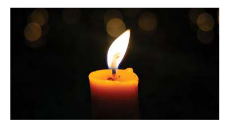
Yom HaShoah, Holocaust Remembrance Day April 7-8

Temple will be participating in a variety of online observances marking solemn and joyous historical anniversaries. Watch for details in Temple communications.