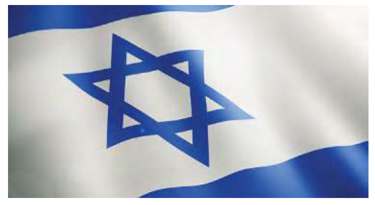
Yom HaZikaron, Israel Day of Remembrance April 13-14

Temple will participate in Dallas community commemorations, and music and reflection will be part of Shabbat services on Friday, April 9.